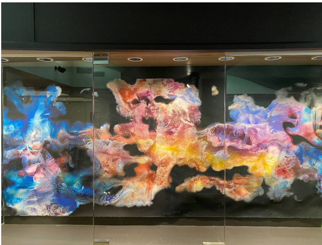
Kawainui – in display case