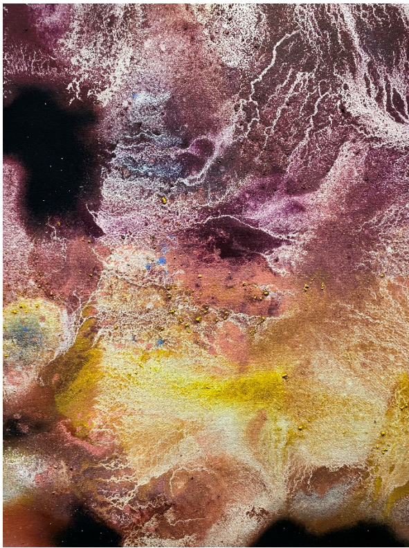
Kawainui - detail