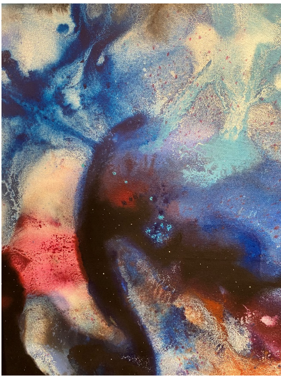
Kawainui - detail