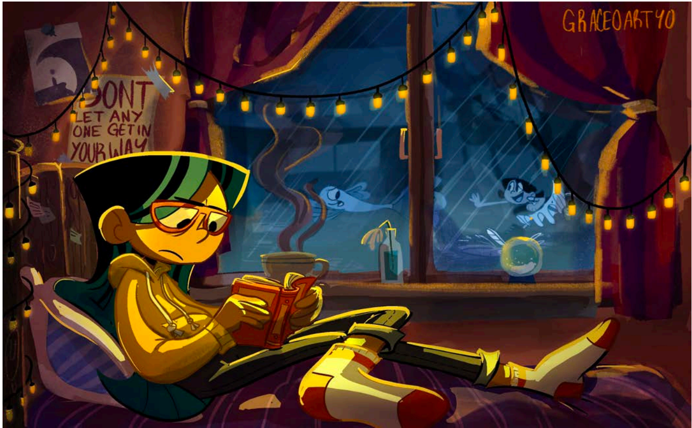
Grace Sullivan Rainy Day Blues Digital Art Gold Key Award