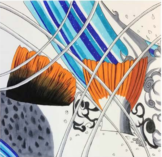
Raiden Lachance Redtail Catfish Drawing and Illustration Silver Key Award