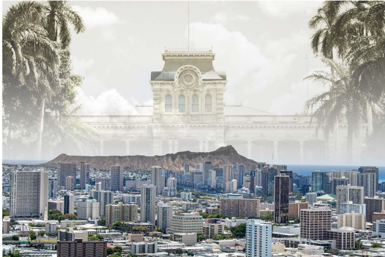
Ryder Kon From Sovereign to Modern American Visions Nominee