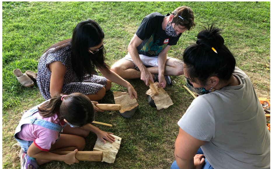
Photo: Kapa making at the Bishop Museum.

- Young of Heart Workshop dba Pu'uhonua Society