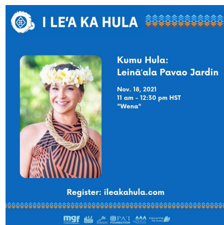
Photos: Left, PA'I Foundation hula workshop. Right, Kahuli Leo Le'a Melehuliā episode 4.